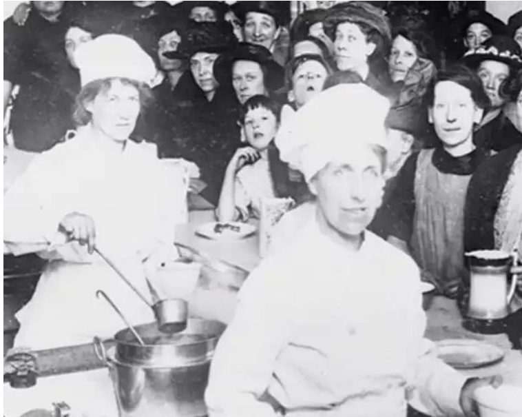
Grub's up.

https://theconversation.com/heres-a-better-alternative-to-food-banks-subsidised-national-kitchens-37928